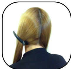
CLIP AWAY ONE SIDE

4- Divide the hair in the middle in two half sections. Clip away one half section from the back towards the front, to keep it out of the way while treating the other side. (Hair Clip Not Included) Repeat it on the opposite side after treating the first half section. Now you are ready to begin treatment.