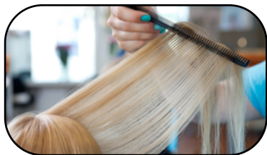
COMB HAIR FREE OF TANGLE