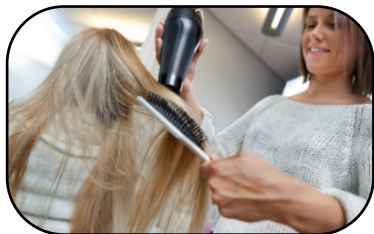
BLOW DRY THE HAIR